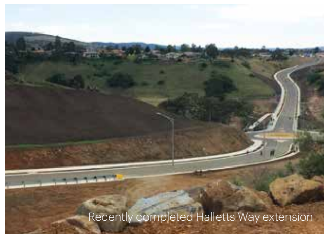
Recently completed Halletts Way extension