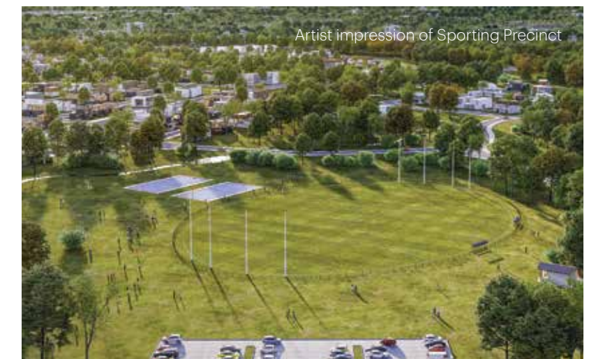
Artist impression of Sporting Precinct

Residents are also a short walk from the new sporting precinct, featuring a full-sized AFL and cricket oval, a pavilion, and tennis and netball courts. Combined with over 50 hectares of parks, landscaped creek corridors and open space, Park View will nurture its community and provide countless gathering spaces for its residents.