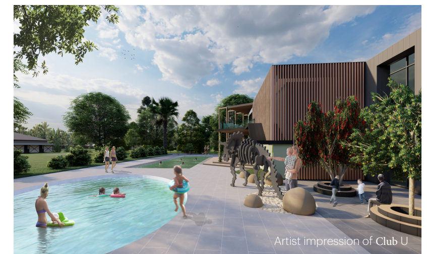
Artist impression of Club U