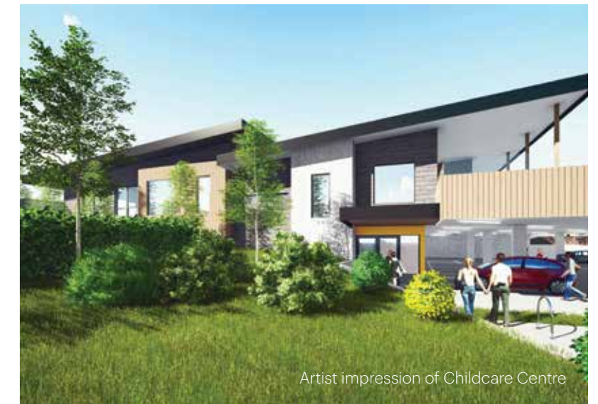
Artist impression of Childcare Centre

provide over 100 places from 2020, providing a local childcare option for our new residents. Where other developments rely on existing townships and infrastructure, Underbank's Town Centre—at the heart of River View—is specifically designed as a gathering point for our residents. A focus on social interaction, with cafes, restaurants and bars, means you can connect with friends, enjoy a great meal and a glass of wine, just moments from your own home. Underbank is about providing more than just houses, we're creating a truly urban way of life.