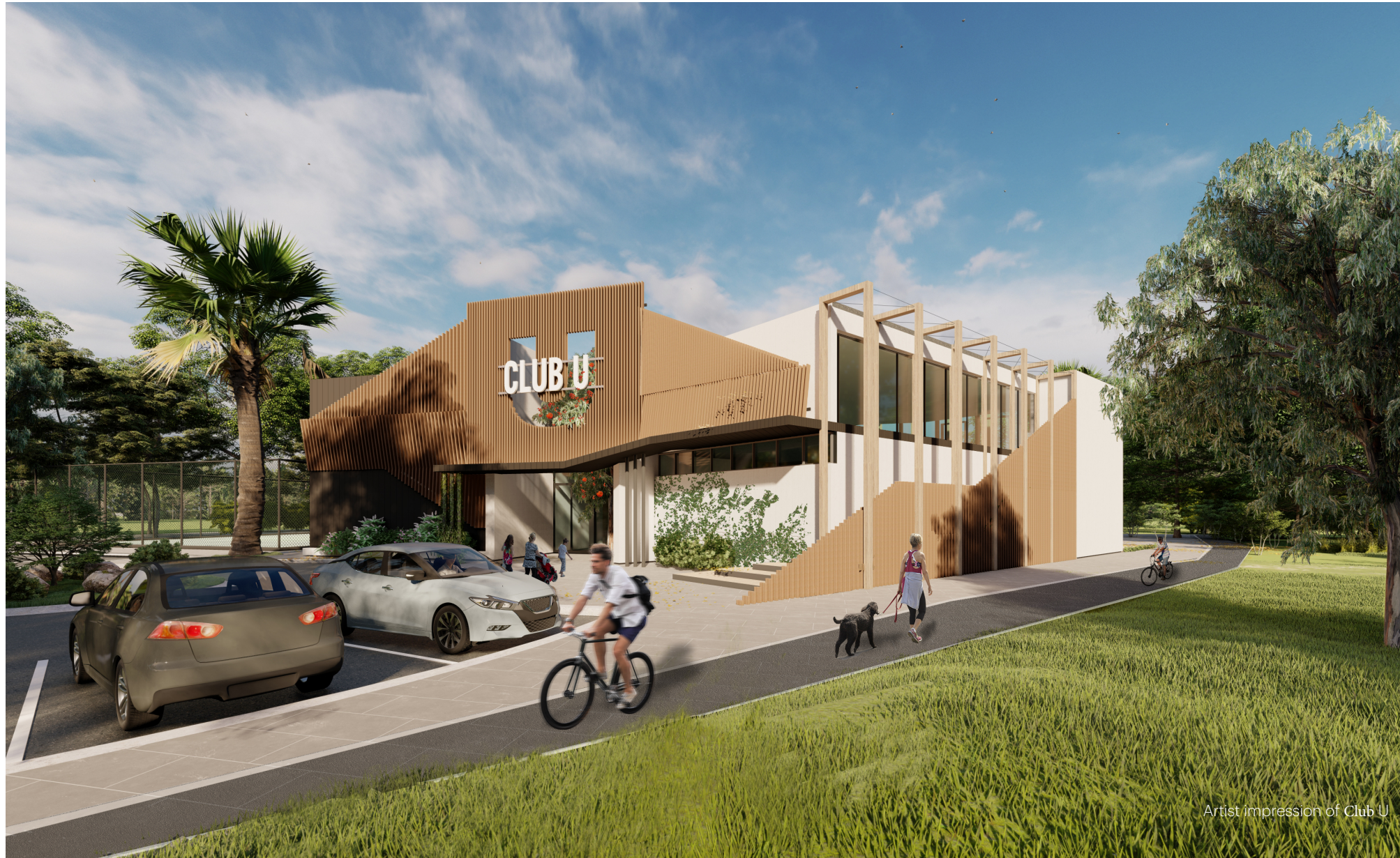
Artist impression of Club U

The expansive Town Centre will include hotel accommodation, restaurants, cafes, speciality shops, and a supermarket. In keeping with the community approach, there is provision for farmers markets, with the potential to attract a range of regional producers selling directly to residents. Alongside the Town Centre is a new lake, with landscaped gardens and lakeside picnic areas, bringing the natural setting directly to the town's centre. For our families with small children, planning for the new Underbank Childcare Centre is well advanced. This state-of-the-art facility will